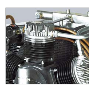
Highly effective cooling Aluminium cylinder heads provide exceptional heat dissipation to ensure extended service life.