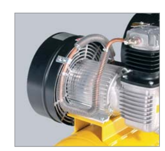
Directly coupled unit Drive motor directly coupled to the compressor block. Low speed operation of only 1500 strokes/min ensures maximum reliability and extended service life.