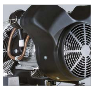
Dual cooling Highly effective cooling with double stream airflow. Crank casing internally cooled to enable maximum pressure up to 10 bar (KCT 401 to 840).