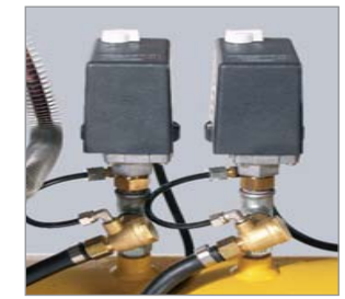
Dual pressure switches Dual pressure switches vent the compressors for unloaded starting. The cut-in and cut-out pressures can also be set separately