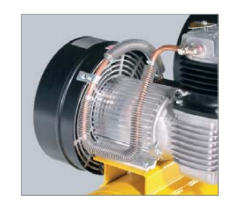
Direct drive Directly coupled units are compact, maintenance-free and eliminate the transmission losses associated with other drive system designs.