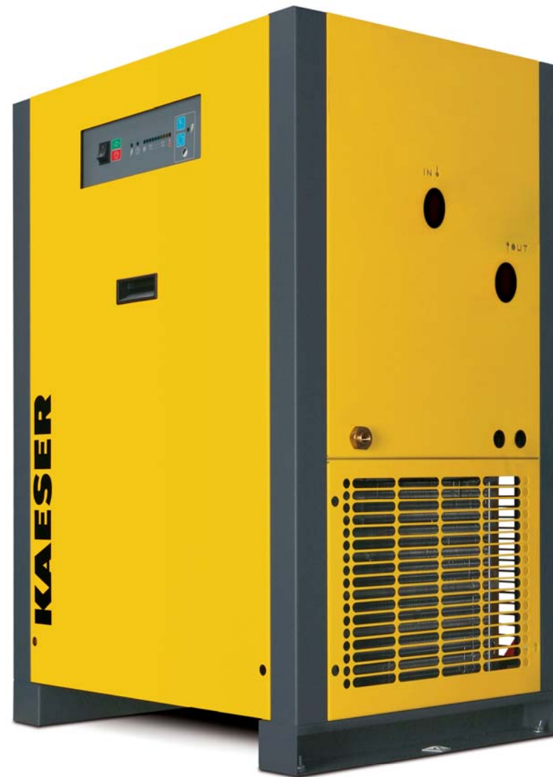
Standard version THP 40-50